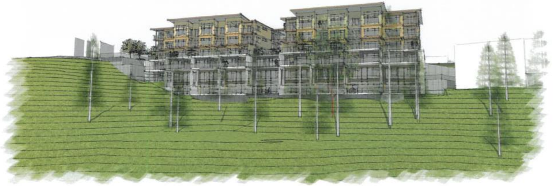
SIX STOREY ELEVATION ARTIST'S RENDERING