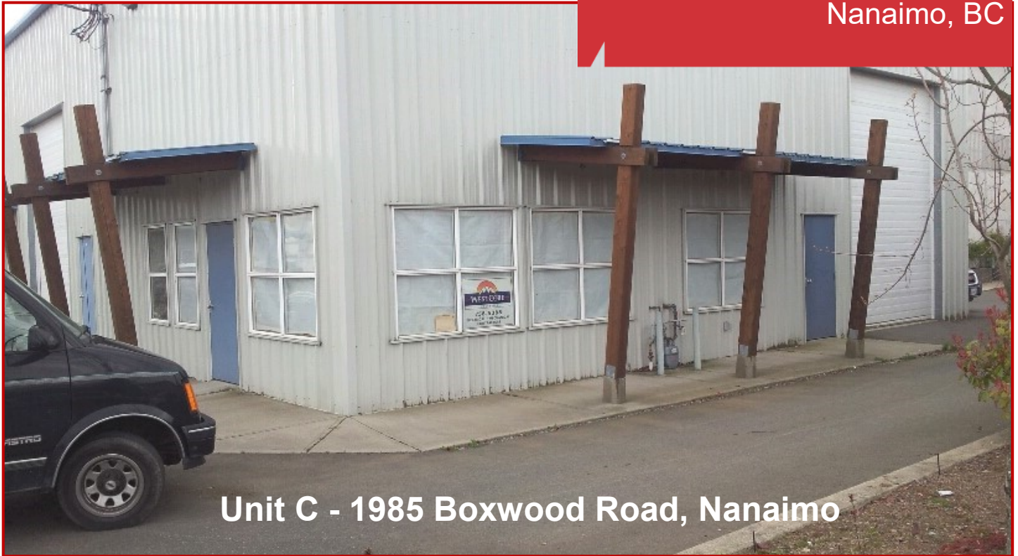
Unit C - 1985 Boxwood Road, Nanaimo

FOR LEASE 2,250 Sq Ft Unit 1985 Boxwood Road Nanaimo, BC